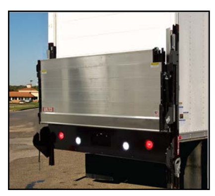
Gate shown in stowed position