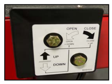
Gravity open, power close