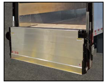
Large folding platform stores at bed height to provide rear door access and convenient dock loading