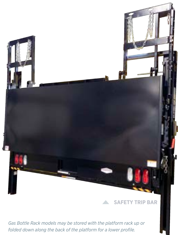
▲ SAFETY TRIP BAR

Gas Bottle Rack models may be stored with the platform rack up or folded down along the back of the platform for a lower profile.