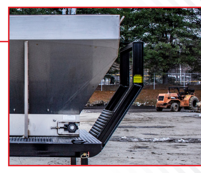
12" Angled Front Extension