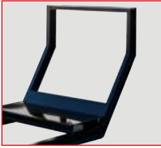
Sloped Front Design