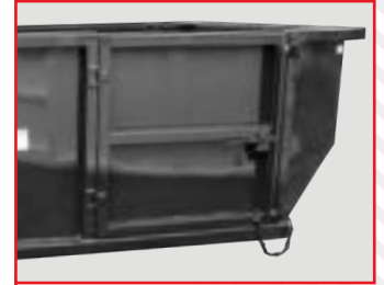
Curbside Door (optional)