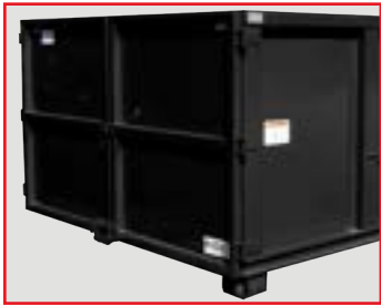
Available in Single Swing or Barn Doors