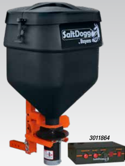
Variable Speed In-Cab Controller with "Blast" and Vibrator Control