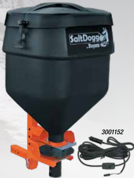
Auxiliary Plug Adapter with ON-OFF Switch