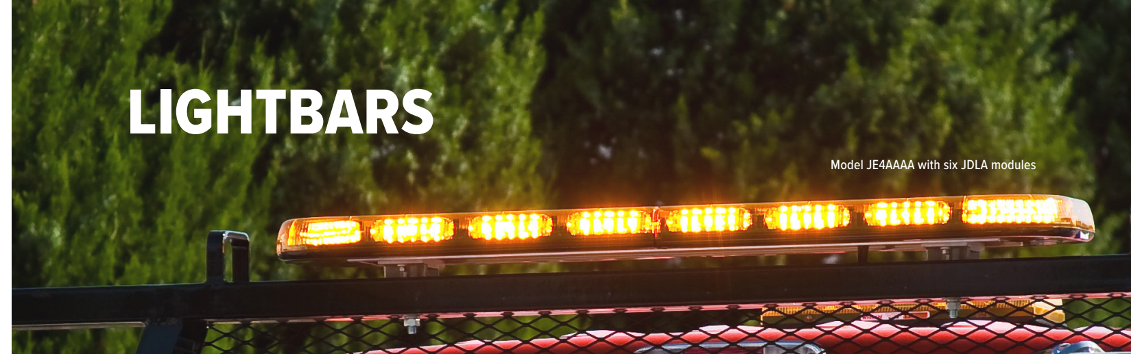
Model JE4AAAA with six JDLA modules