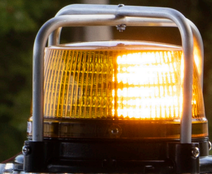
Model L31HAF with L360BGB