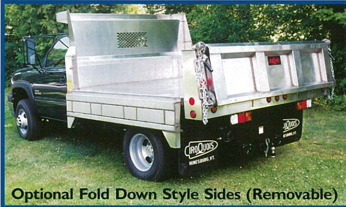
Optional Fold Down Style Sides (Removable)