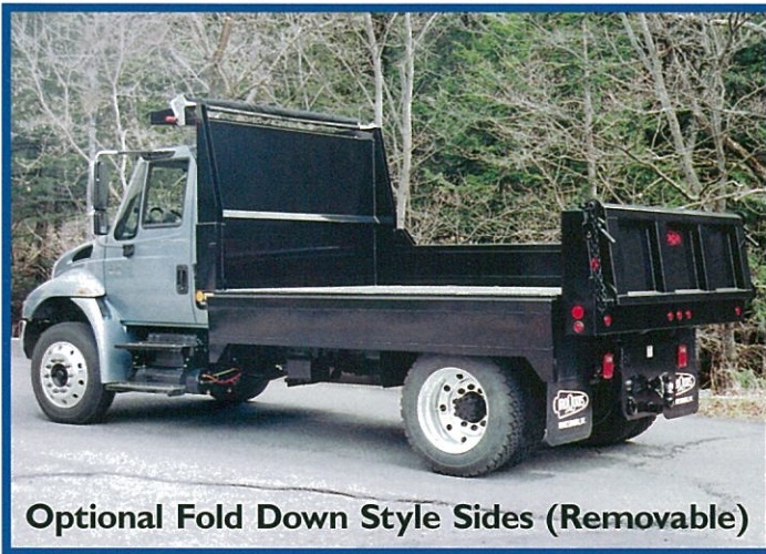
Optional Fold Down Style Sides (Removable)